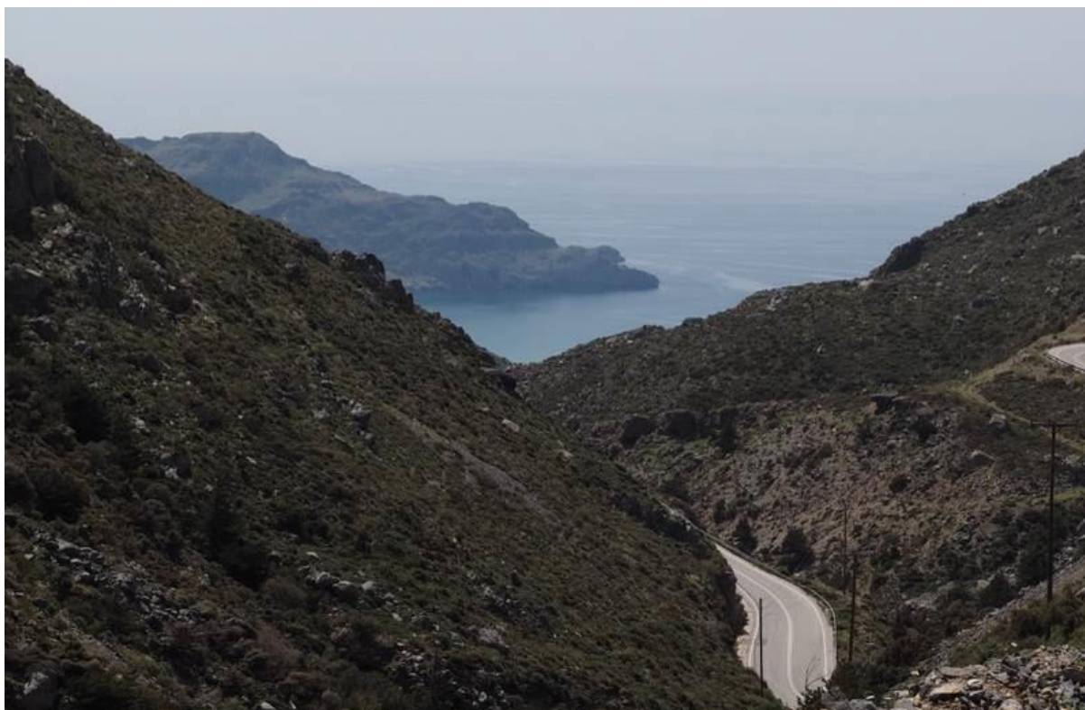
The view down Kotsifou Gorge