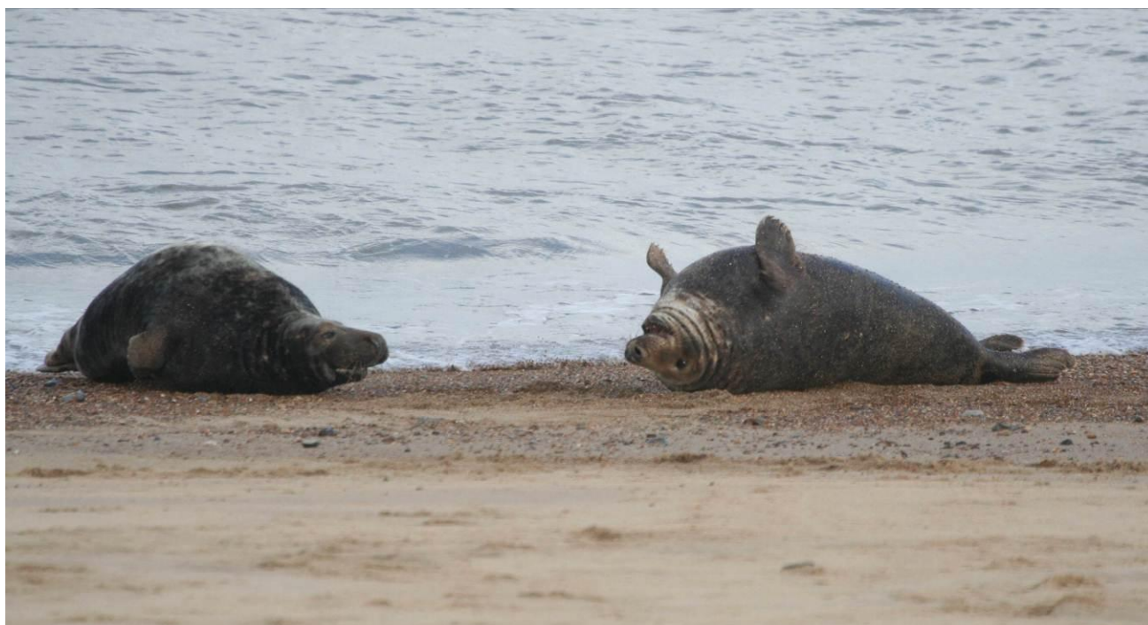
Grey Seals at Horsey Gap... suitable captions welcome!

Cover: sunset at Welney, and Otter at Strumpshaw Fen