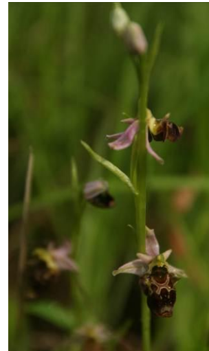
Top row, l to r: Scarce Copper, Marbled Fritillary and Mountain Alcon Blue Middle row, l to r: Wartbiter and young Eastern Imperial Eagle being mobbed by male Marsh Harrier Bottom row, l to r: Pedicularis exaltata , Melampyrum nemorosum , Melampyrum cristatum and Ophrys holubyana