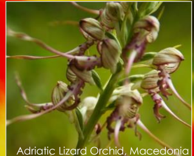
Adriatic Lizard Orchid, Macedonia