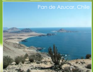
Pan de Azucar, Chile