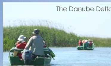
The Danube Delta