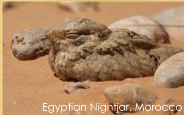
Egyptian Nightjar, Morocco