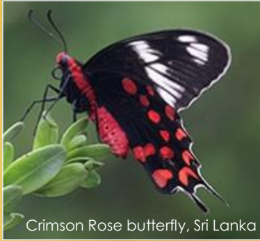
Crimson Rose butterfly, Sri Lanka