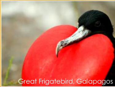
Great Frigatebird, Galapagos