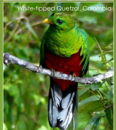
White-tipped Quetzal, Colombia