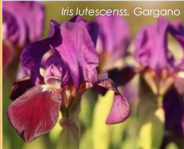
Iris lutescens , Gargano