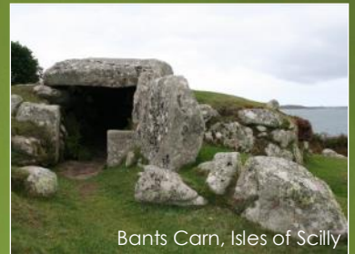
Bants Carn, Isles of Scilly