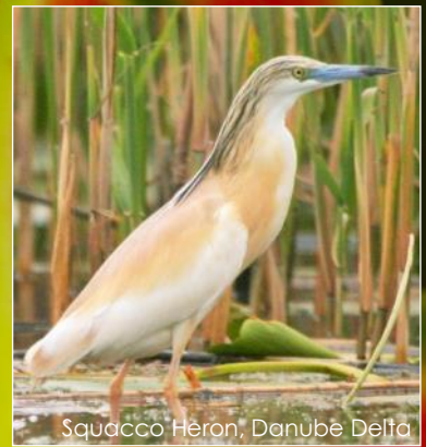
Squacco Heron, Danube Delta

£645 per person, B&B, single room supplement £100