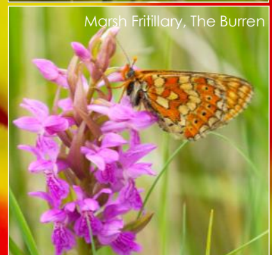
Marsh Fritillary, The Burren