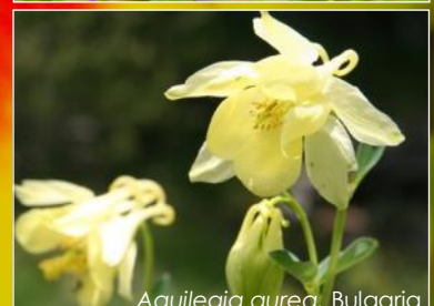
Aquilegia aurea, Bulgaria