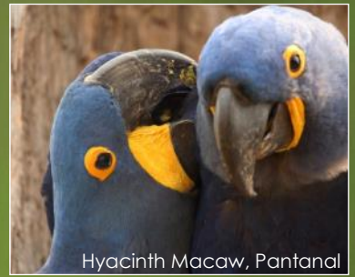
Hyacinth Macaw, Pantanal