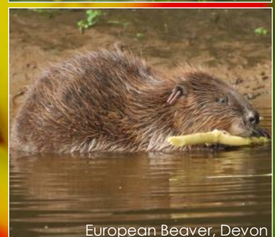
European Beaver, Devon