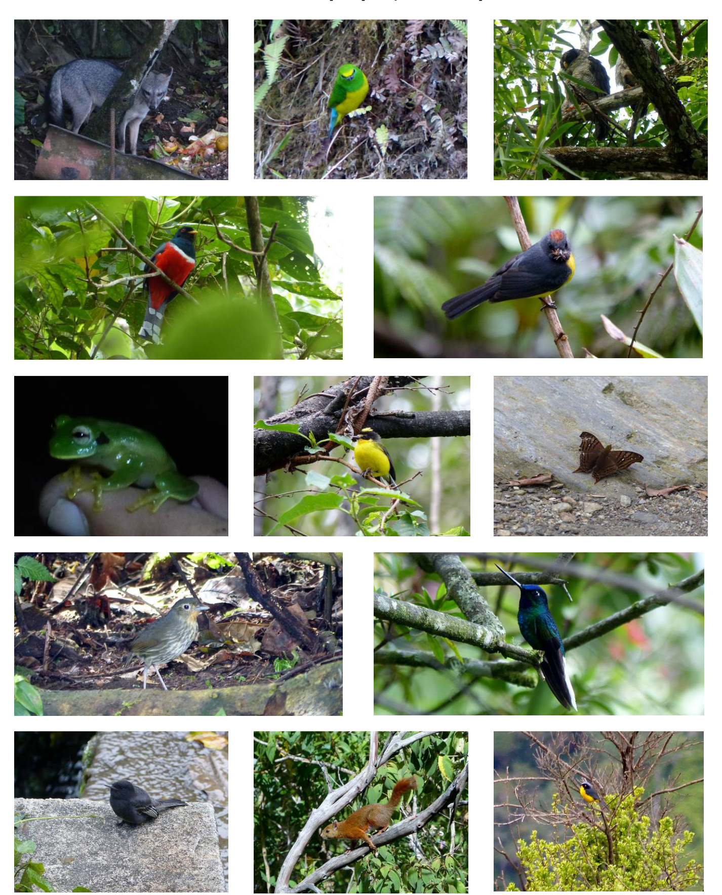
Left to right - Crab-eating Fox; Blue-naped Chlorophonia; Black-and-white Owl; Masked Trogon; Slate-throated Whitestart; Santa Marta Glass Frog; Yellow-crowned Whitestart; False Daggerwing; Santa Marta Antpitta; White-tailed Starfrontlet; Black Phoebe; Red-tailed Squirrel; Santa Marta Mountain Tanager.