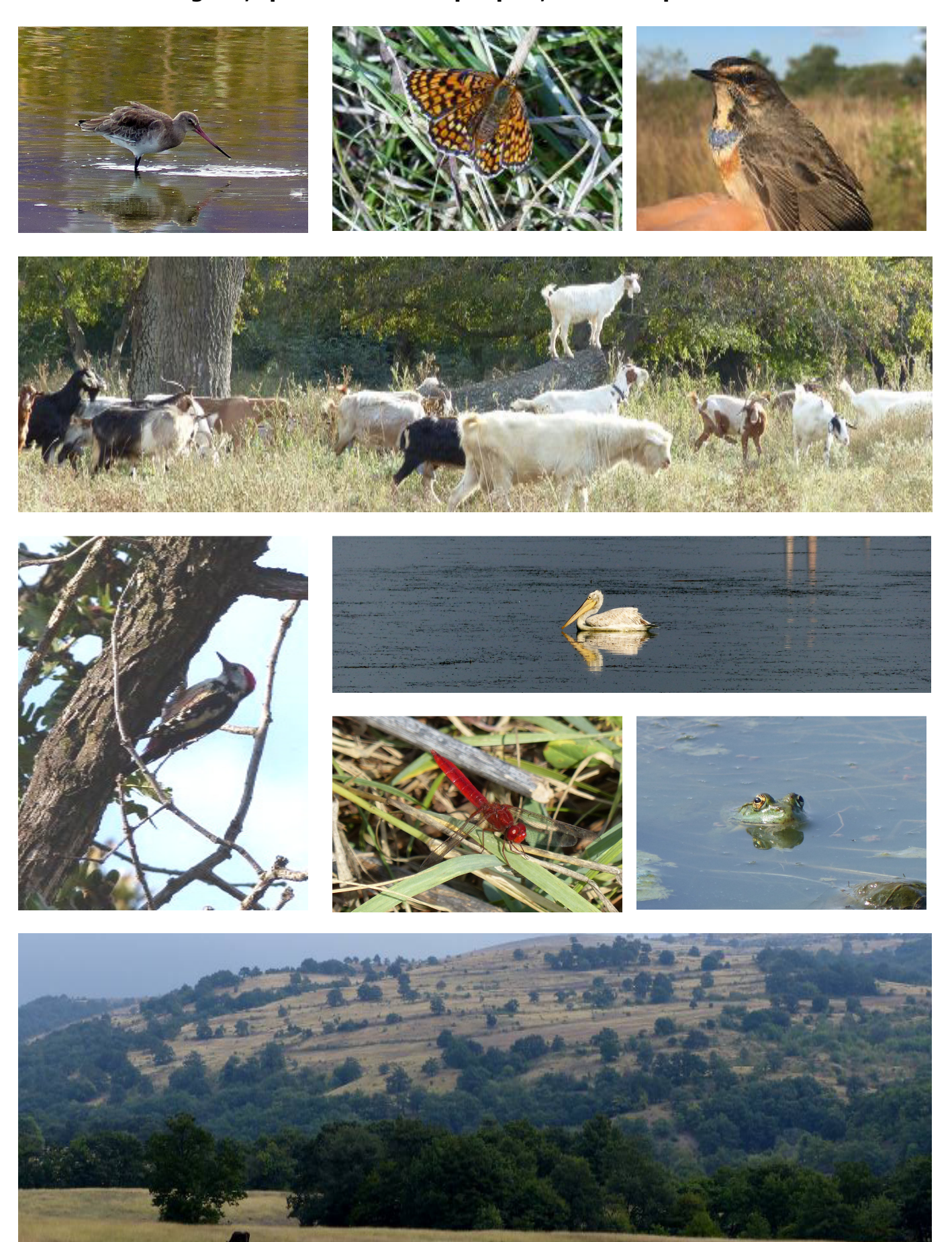
Top - Black-tailed Godwit; Knapweed Fritillary; Bluethroat. Middle - Poroy; Middle Spotted Woodpecker; Dalmatian Pelican; Scarlet Darter; Marsh Frog. Bottom - Jurino Pass.