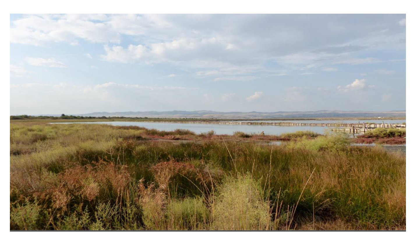
Above - Aranasovsko Lake. Front cover - Durankulak