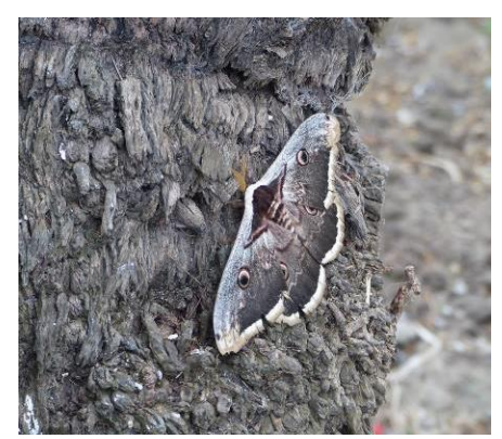
Top - Sierra de la Plate. Left - Western Dappled White. Centre - White Stork. Right - Great Peacock