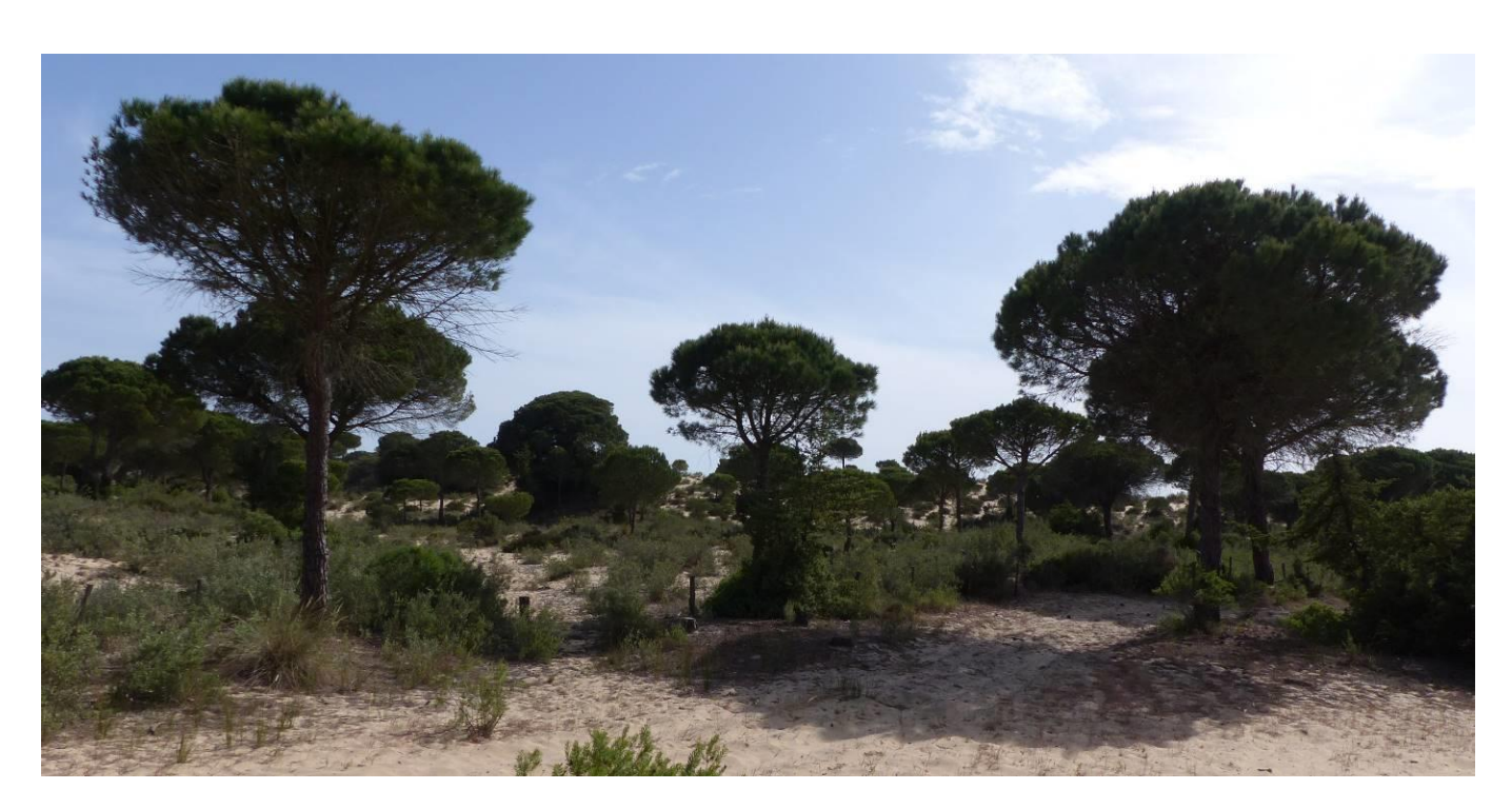
Left - Little Swift. Right - White-headed Duck. Bottom - Doñana National Park.

After another marathon lunch in Sanlúcar de Barrameda we crossed the Guadalquivir River into Doñana National Park. We had a tour around the southern route of the National Park to experience its range of sand dune, marsh and scrub habitats. On the beach were mixed gull and tern flocks including Little Tern,