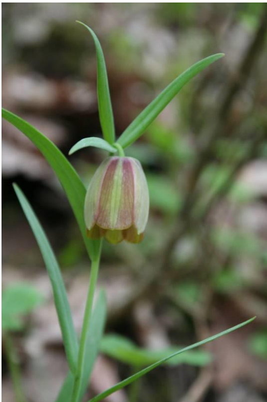
Fritillaria pontica in the Strandja woods