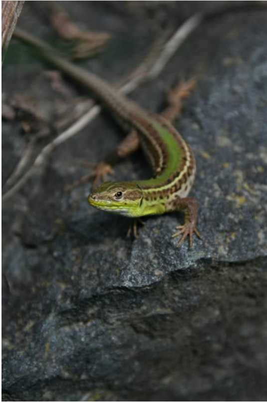
Balkan Wall Lizard, Strandja