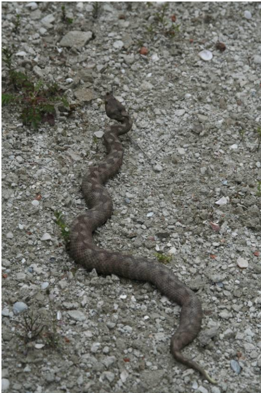
Nose-horned Viper, Ropotamo