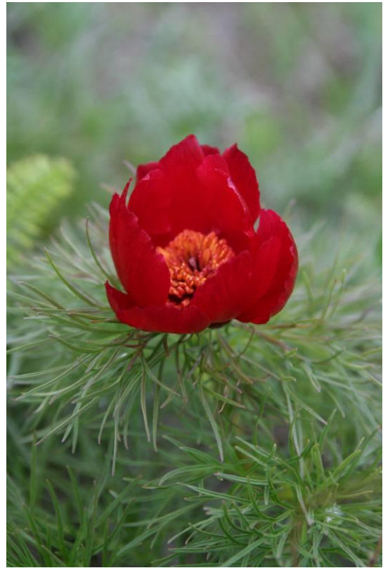
Paeonia tenuifolia on the Kaliakra steppe