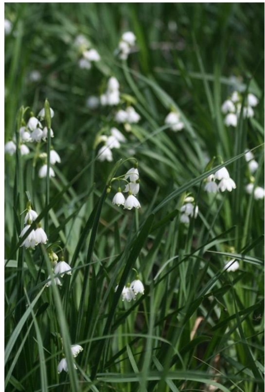
Leucojum aestivum in wet woodland, Baltata