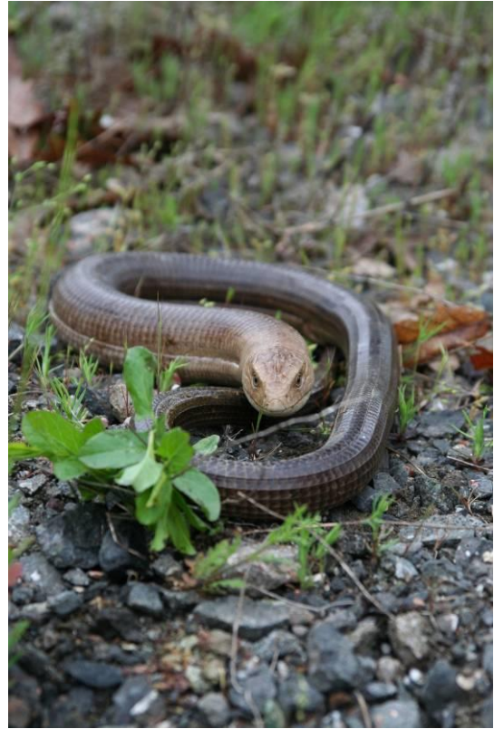
European Glass Lizard, Alepu