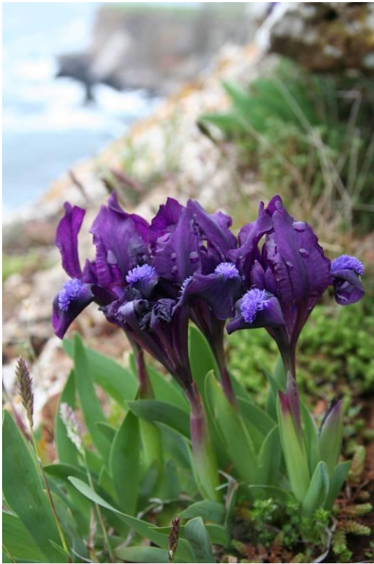
Iris pumila on the cliffs at Yailata