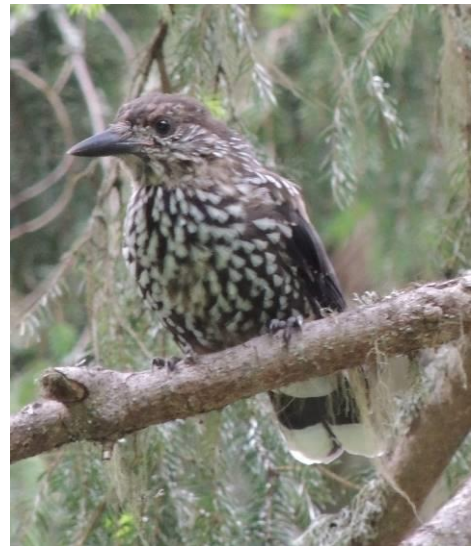
Left to right: Sombre Tit, Ring Ouzel and Nutcracker