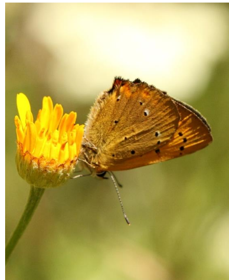
Left to right: Poplar Admiral, Ottoman Brassy Ringlet and Scarce Copper