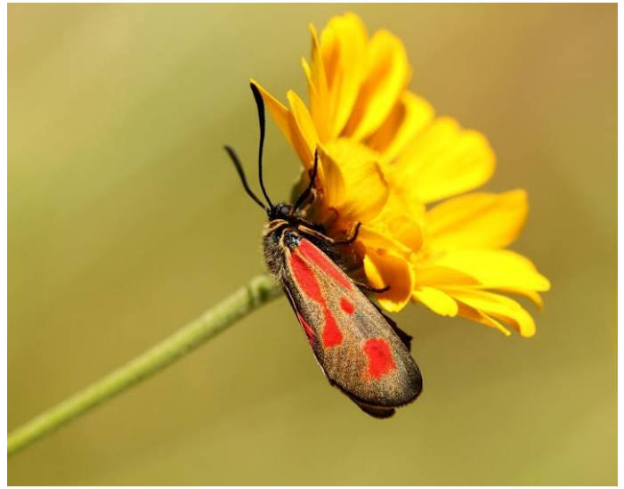
Left to Right: Centaurea triumphettii, Dactylorhiza saccifera, Zygaena viciae