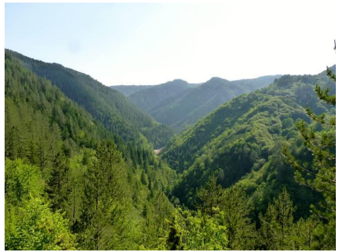
Left (top to bottom): Teshel, Kastrakali Nature Reserve, Pirin National Park