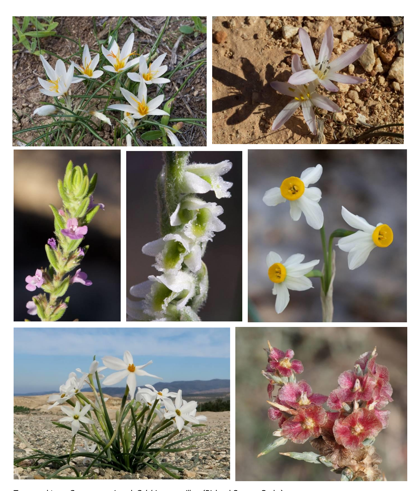
Top row, I to r: Crocus veneris and Colchicum pusillum Middle row, I to r: Micromeria cristata, Spiranthes spiralis and Narcissus tazetta Bottom row, I to r: Narcissus serotinus and Noaea mucronata