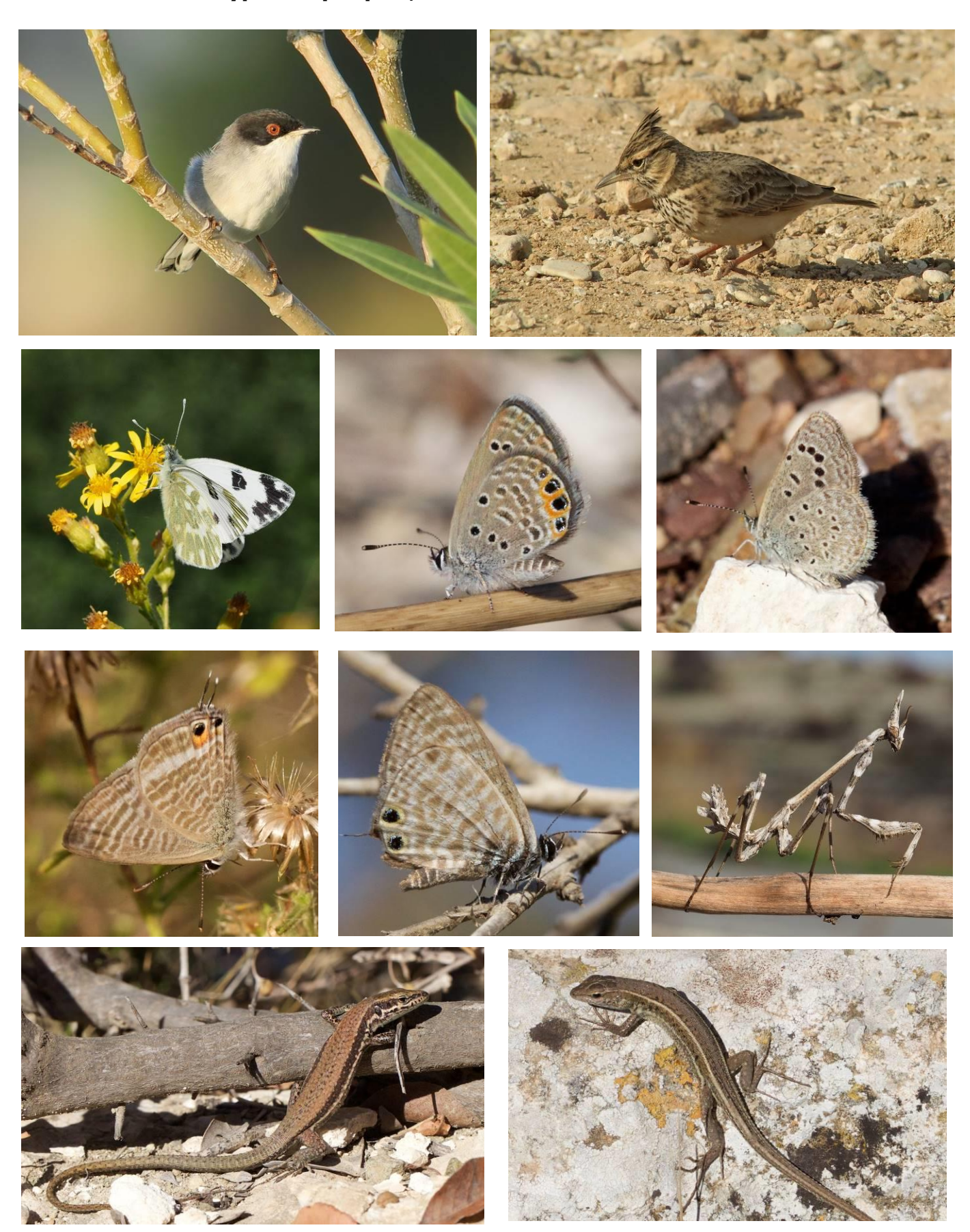
Top row, I to r: Sardinian Warbler and Crested Lark (both RSC) Second row, I to r: Eastern Bath White (YC), Grass Jewel and African Grass Blue (RSC) Third row, I to r: Long-tailed Blue, Lang's Short-tailed Blue (RSC) and Empusa fasciata (YC) Bottom row, I to r: Troodos Wall Lizard and Snake-eyed Lacertid (both RSC)