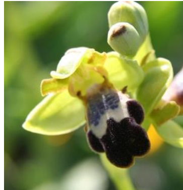
O. israelitica no V-groove in throat, white W