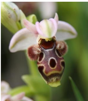
Ophrys umbilicata pink sepals, lip tucked under