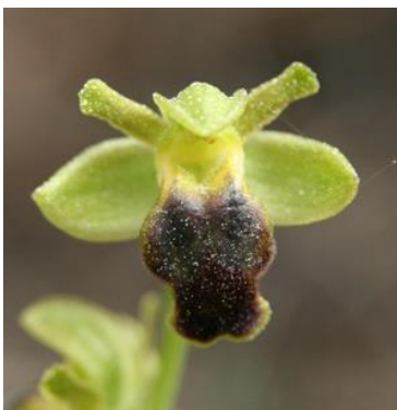
Ophrys fusca V-groove in 'throat', yellow margin