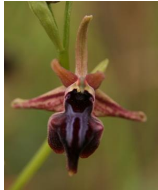
O. morio purple-black 'throat'