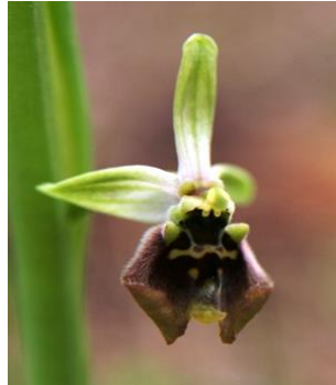
O. bornmuelleri short 'ears', lip flared forward