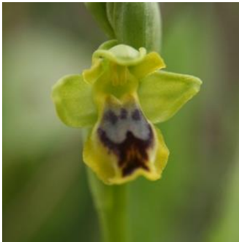
Ophrys sicula the yellow one

The largest and most confusing group of orchids is the genus Ophrys , the 'bee orchids'. With up to 16 species found on Cyprus (of which we found 13) this can be a very confusing group! Luckily, they fall into several smaller 'bite size' groups which make the genus much more manageable.