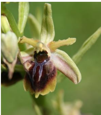
Ophrys asiatica brown 'throat', pale lip margin