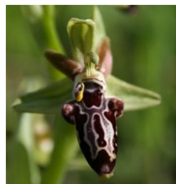
O. kotschyi unique!