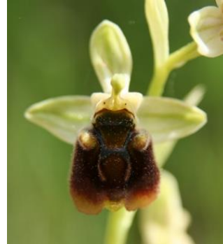
O. levantina short 'ears' lip curled back