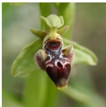
O. attica green sepals, lip tucked under