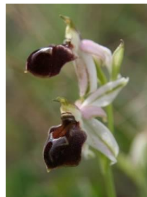
O. elegans sepals swept back, goggles