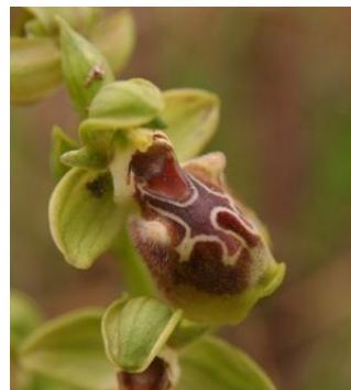
O. flavomarginata yellow margin to lip, flared forward