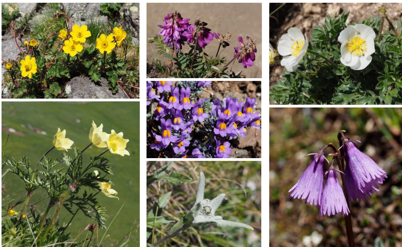
Left column: Geum reptans (top) and Pulsatilla alpina (bottom)

30th June. As we had an hour or so in the morning before our transport arrived we set off from our hotel on the road to Val Duron. We soon found our first orchids, Platanthera bifolia , and Ophrys insectifera growing on a bank and then went up a sidetrack to check whether the plants of Goodyera repens were in flower now. We saw Musk Orchid again but the Goodyera was still only in bud. After one last look at the Lilium martagon by the river, we returned to board our mini-bus and to travel once more through the dramatic valleys of the Dolomites towards the airport in Venice.