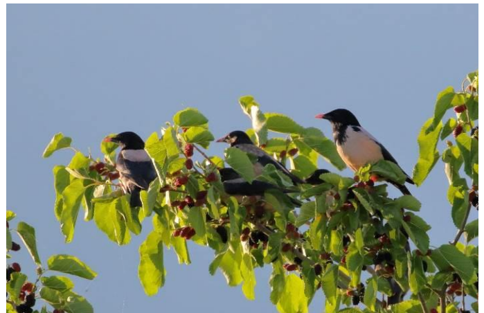
From left - Dalmatian Pelican; Rose-coloured Starling.