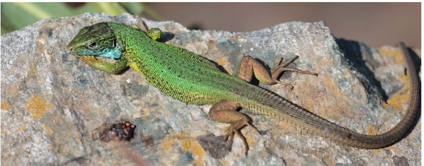
From top - Purple-shot Copper; Black-crowned Night Heron; Spoonbills; European Glass Lizard; Eastern Green Lizard.