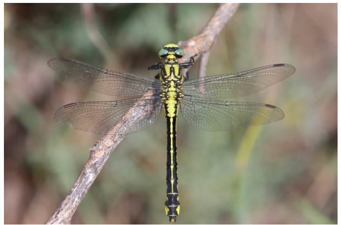
From left - Horned Woodcock Orchid Ophrys oestrifera ; Common Glider; Club-tailed Dragonfly.