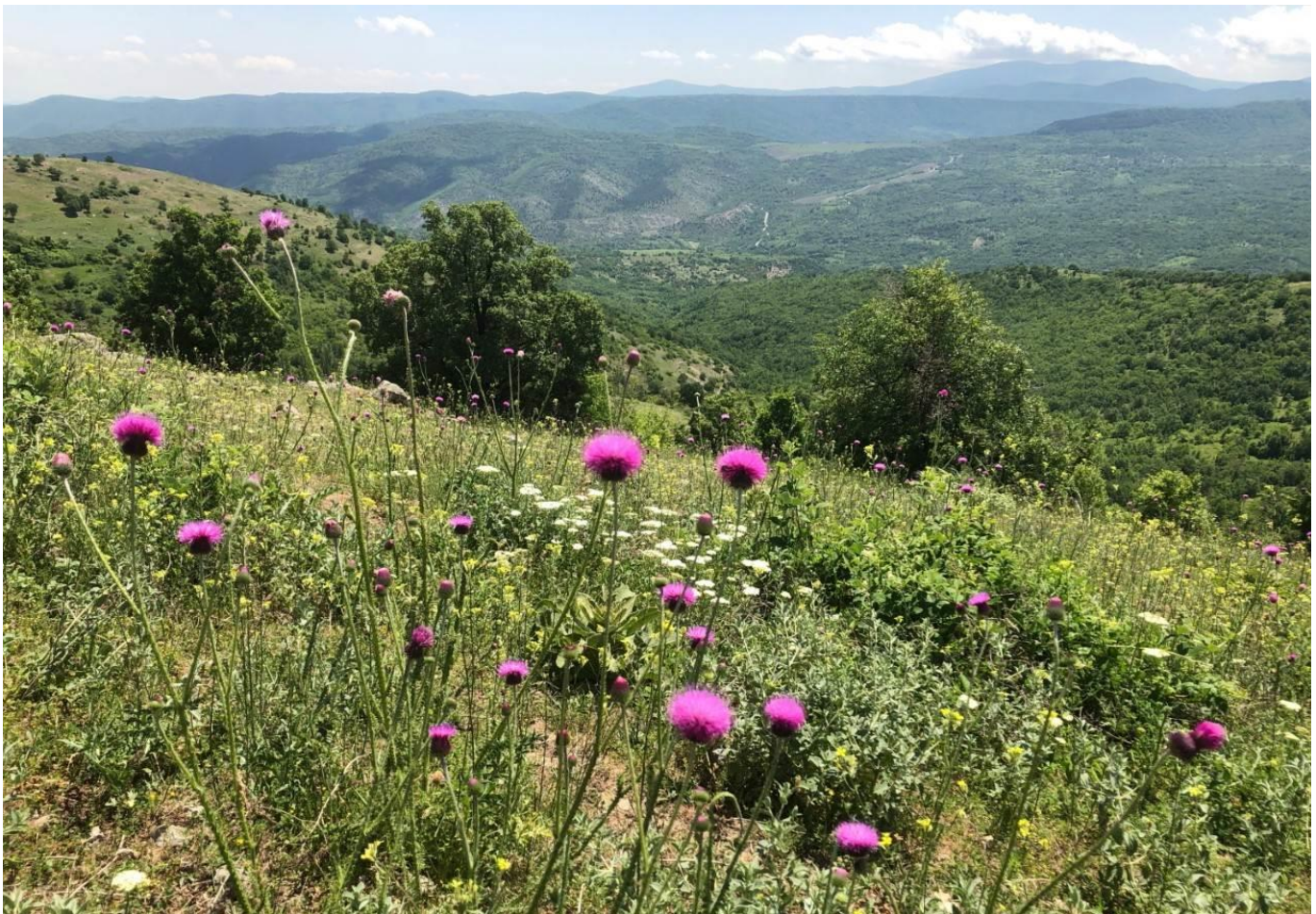
Above - Vitachevo Plateau. Front cover - Lake Kerkini.