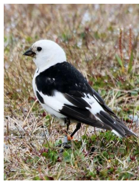
Left to Right: Brünnich's Guillemot, Ivory Gull, Snow Bunting