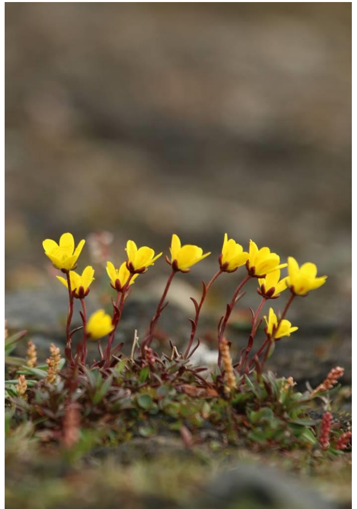
Top: Captain Jim. Left: Polar Campion Silene uralensis . Right: Yellow Marsh Saxifrage Saxifraga hirculus