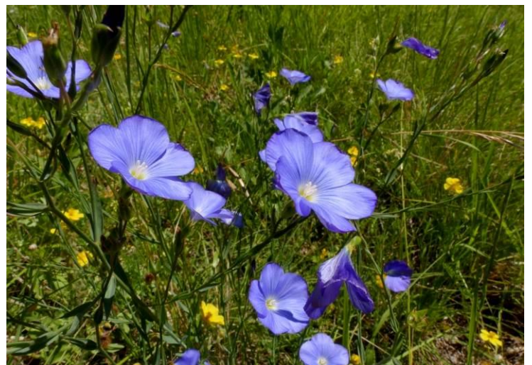
Top: Apollo; Hairy Rock-jasmine Androsace villosa (PS). Bottom: Moonwort Botrychium lunaria (PS); Silver-studded Blue and Small Blue (PS); Narbonne Flax Linum narbonense .