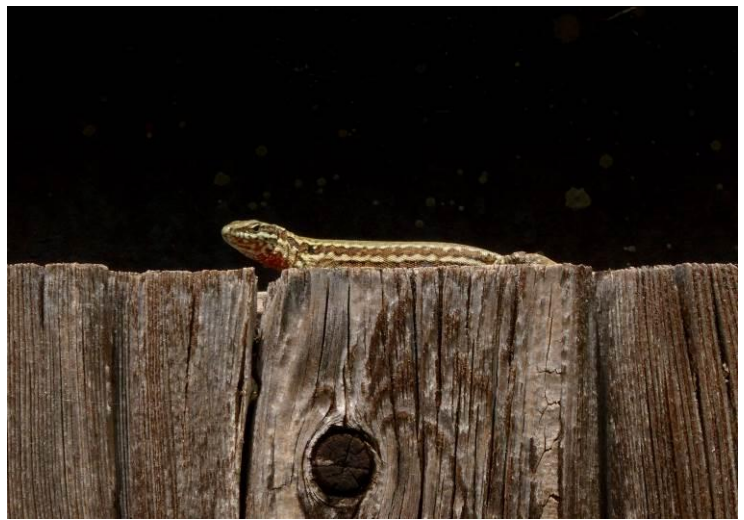
Top: Clusius's Gentian Gentiana clusii ; Coralroot Orchid Corallorhiza trifida . Bottom: Pearly Heath (PS); the group in Vallon de Combeau; Common Wall Lizard.