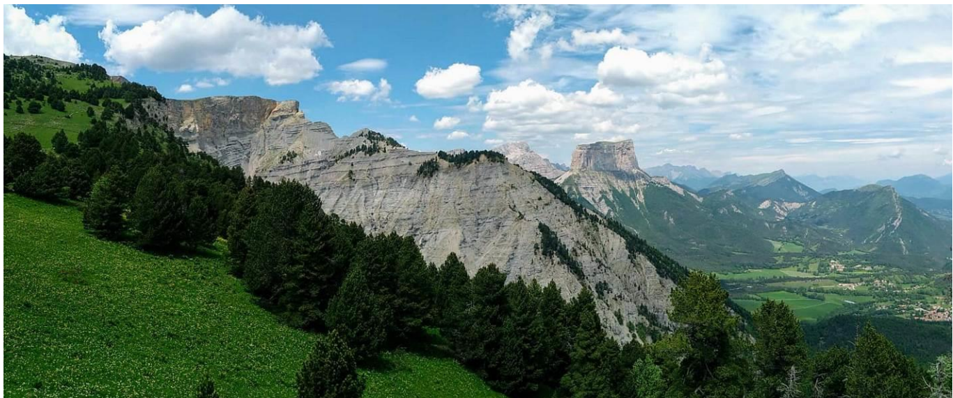
Above: Mont Aiguille (PS)