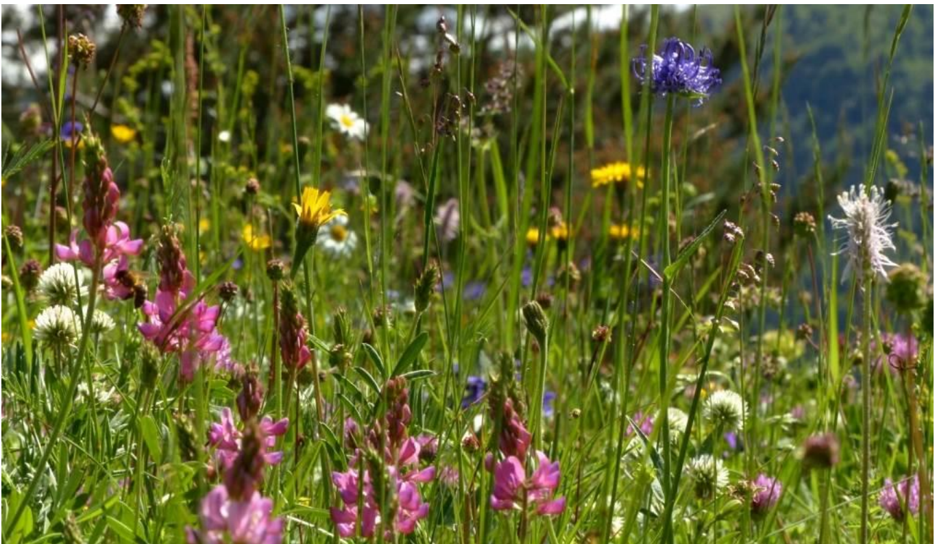
Above: alpine meadow