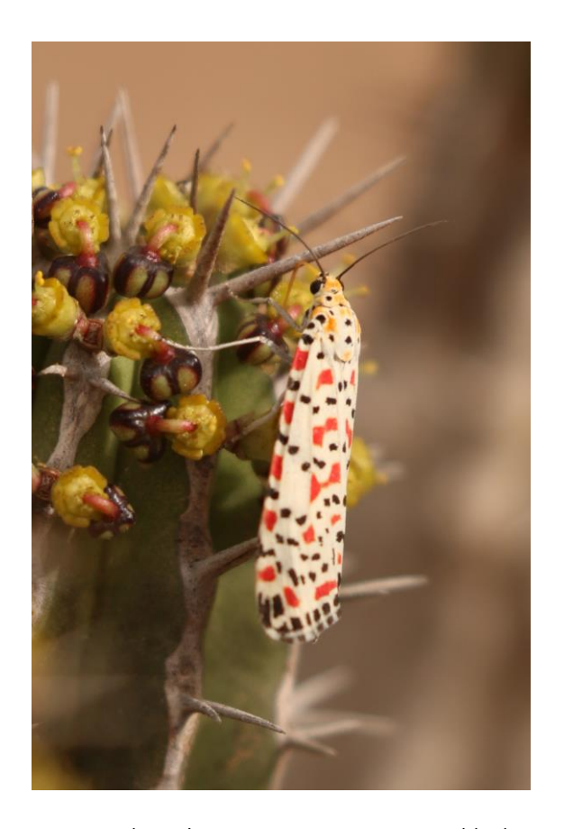
Photos (clockwise, from top left): Cream-coloured Courser, Bibron's Agama, Crimson Speckled, Red-necked Ostrich