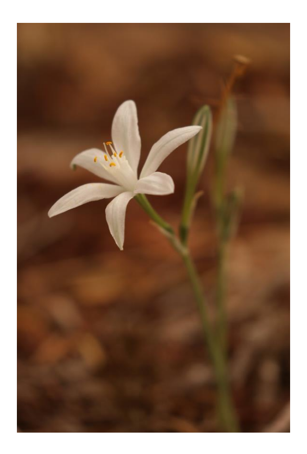
Photos (clockwise, from top left): Orbea decaisneana subsp hesperidum, Echinops spinosissimus subsp spinosus, Vagaria ollivieri, Hannonia hesperidum