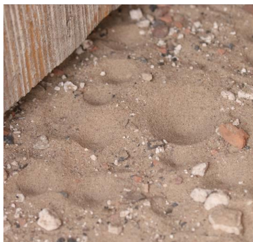
Scarce Chaser at Strumpshaw: ant lion pits at Holkham