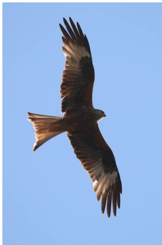
Top left: Spanish Catchfly Silene otites . Top right: Field Wormwood Artemisia campestris Bottom left: Common Tern (top) and Sandwich Tern (bottom). Bottom right: Red Kite