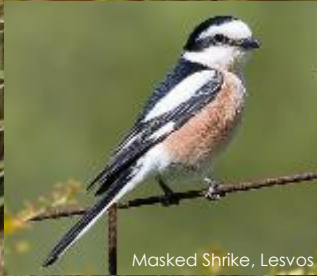
Masked Shrike, Lesvos