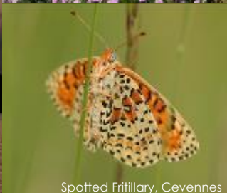
Spotted Fritillary, Cevennes