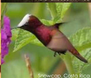
Snowcap, Costa Rica