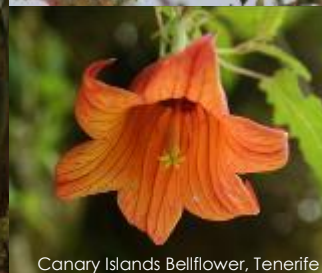
Canary Islands Bellflower, Tenerife