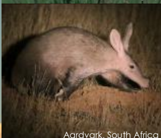
Aardvark, South Africa