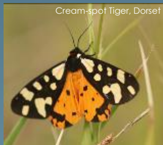
Cream-spot Tiger, Dorset

"a phenomenal holiday... such special memories" 2023