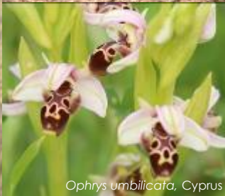
Ophrys umbilicata, Cyprus