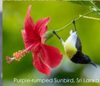
Purple-rumped Sunbird, Sri Lanka