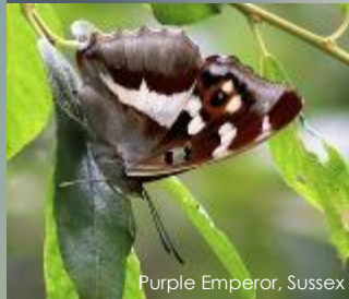
Purple Emperor, Sussex Whitby coastline, Yorkshire