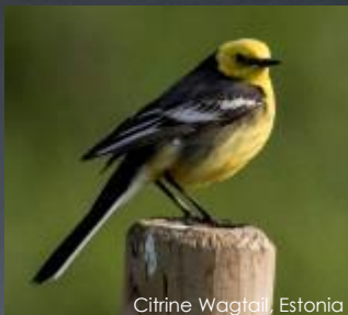
Citrine Wagtail, Estonia

"a success... enjoyed the abundance of wildlife" 2019