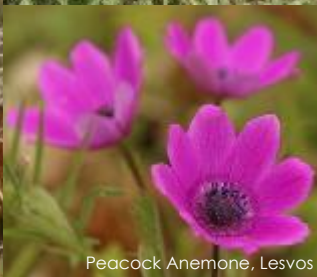
Peacock Anemone, Lesvos