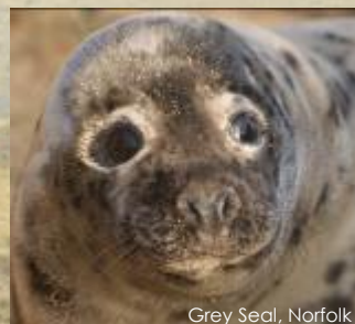
Grey Seal, Norfolk

"a truly wonderful hotel, felt like home immediately" 2020