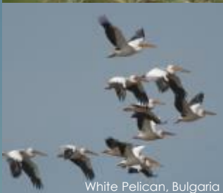
White Pelican, Bulgaria