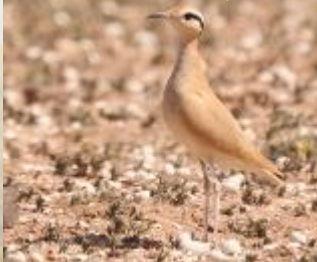
Cream-coloured Courser, Morocco

"hotel in excellent location, food very good" 2023