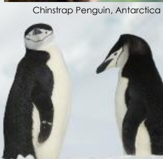
Chinstrap Penguin, Antarctica