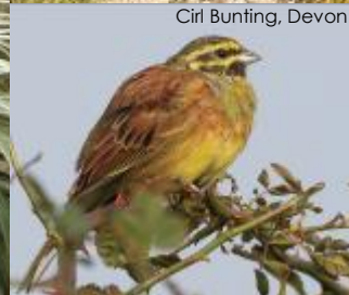
Cirl Bunting, Devon