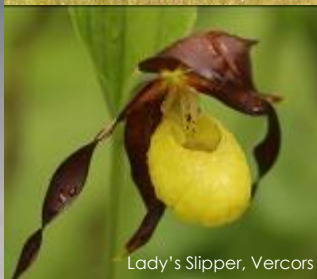
Lady's Slipper, Vercors

"beautiful scenery, excellent food... couldn't be better" 2022