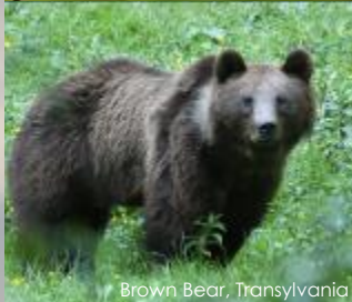
Brown Bear, Transylvania