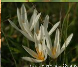
Crocus veneris, Cyprus