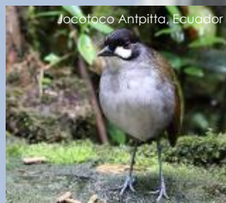
Jacotoco Antpitta, Ecuador

NEW ITINERARY FOR 2024, START/FINISH IN USHUAIA