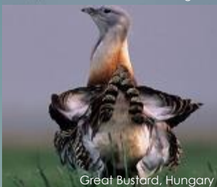
Great Bustard, Hungary