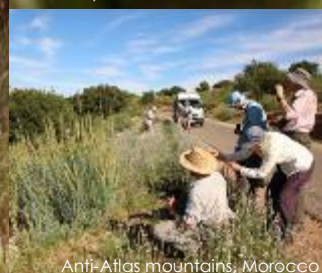
Anti-Atlas mountains, Morocco