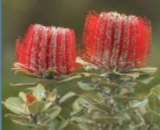
Banksia coccinea, Western Australia

"beautifully sited hotel, food very enjoyable" 2023