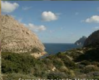
Formentor peninsula, Mallorca