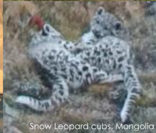
Snow Leopard cubs, Mongolia