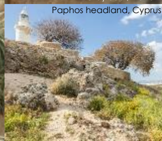
Paphos headland, Cyprus