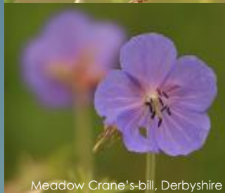
Meadow Crane's-bill, Derbyshire