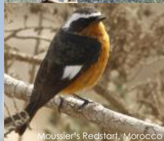
Moussier's Redstart, Morocco