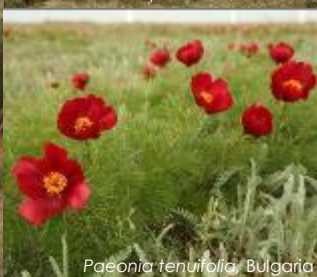
Paeonia tenuifolia, Bulgaria