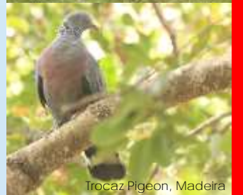
Trocaz Pigeon, Madeira