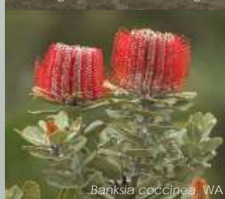
Banksia coccinea, WA Stirling Range NP, WA