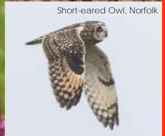
Short-eared Owl, Norfolk