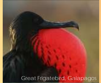
Great Frigatebird, Galapagos