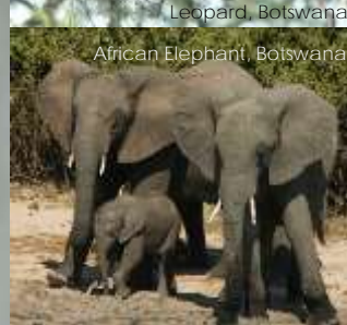
African Elephant, Botswana