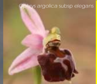
Ophrys argolica subsp elegans

"beautiful, interesting landscapes... active but relaxed" 2023