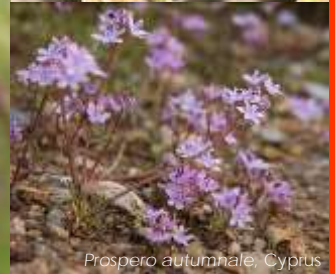
Prospero autumnale, Cyprus