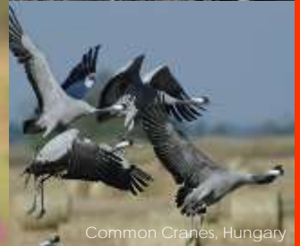
Common Cranes, Hungary