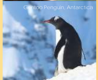
Gannet Penguin, Antarctica