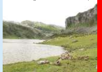
Lago Enol, Picos de Europa