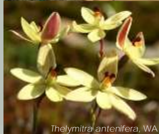
Thelymitra antenifera, WA