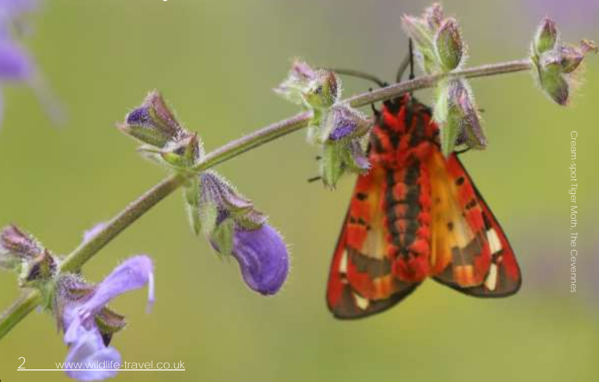
Cream-spot Tiger Moth, The Cevennes