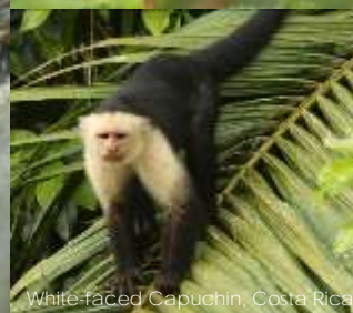
White-faced Capuchin, Costa Rica