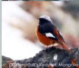
Güldenstädt's Redstart, Mongolia