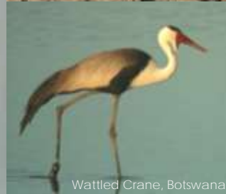
Wattled Crane, Botswana