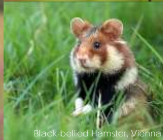
Black-bellied Hamster, Vienna