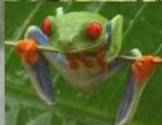
Red-eyed Tree Frog, Costa Rica