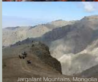
Jargalant Mountains, Mongolia