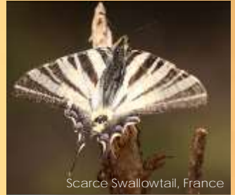
Scarcie Swallowtail, France

"exceeded expectations... fabulous food" 2018