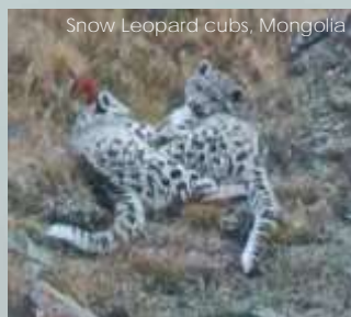
Snow Leopard cubs, Mongolia

"ten out of ten... mind blowing! A brilliant trip" 2014