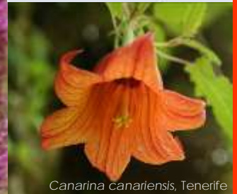
Canarina canariensis, Tenerife