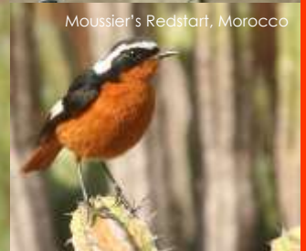
Moussier's Redstart, Morocco