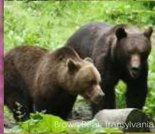
Brown Bear, Transylvania