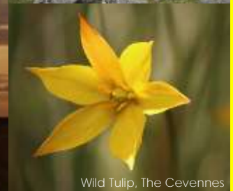
Wild Tulip, The Cevennes