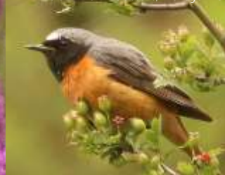
Common Redstart, Derbyshire