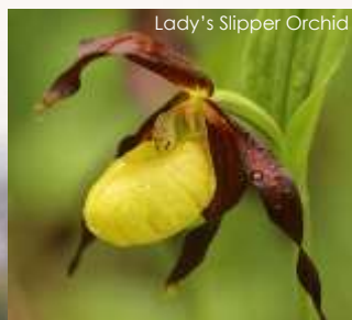
Lady's Slipper Orchid