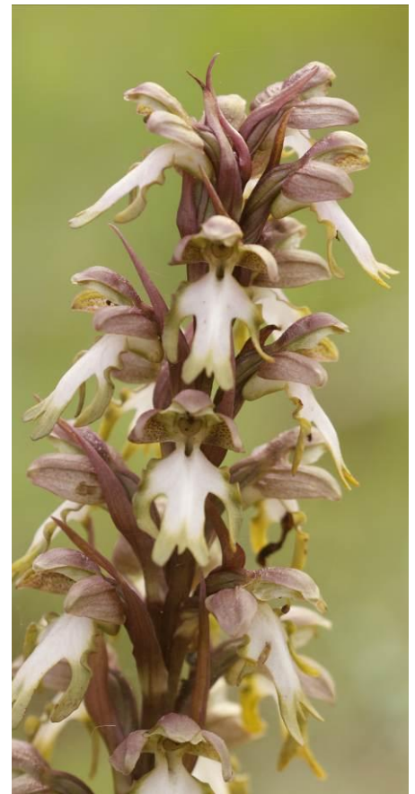
Above (left to right): Ophrys omegaifera subsp israelitica , Serapias bergonii and Himantoglossum robertianum