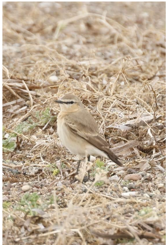
(clockwise, from top left): Tawny Pipit at Tombs of the Kings; Dactylorhiza romana at Smygies; Isabelline Wheatear at Mandria; Ophrys sphegodes subsp taurica , Symgies