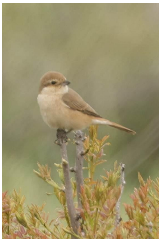
(clockwise, from top left): Cyprus Wheatear near Latchi, Cretzschmar's Bunting at Tombs of the Kings, Isabelline Shrike at Paphos Headland, Namaqua Dove at Mandria